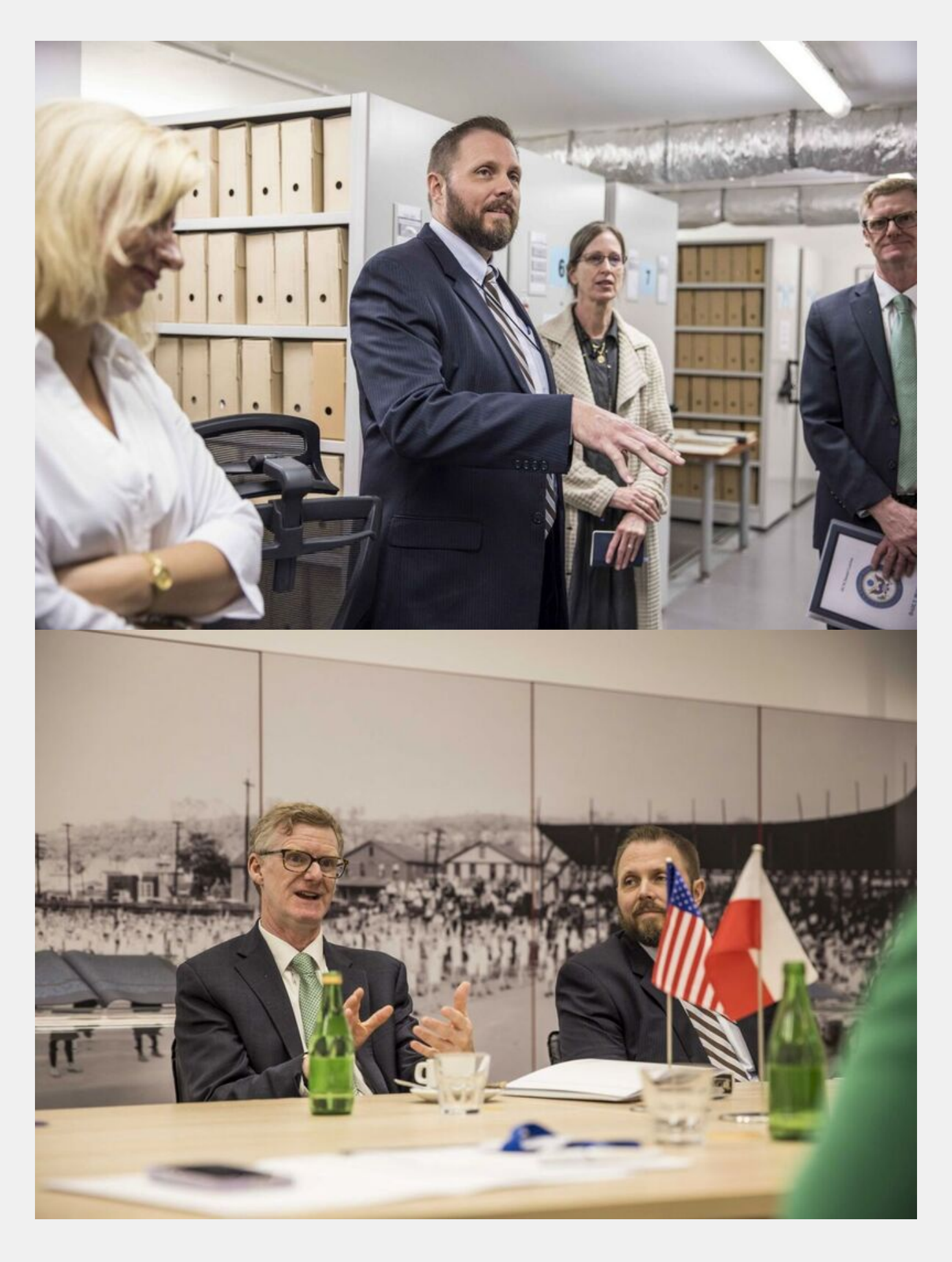
On 7 August 2023, the IPN Archive was visited by Deputy Chief of