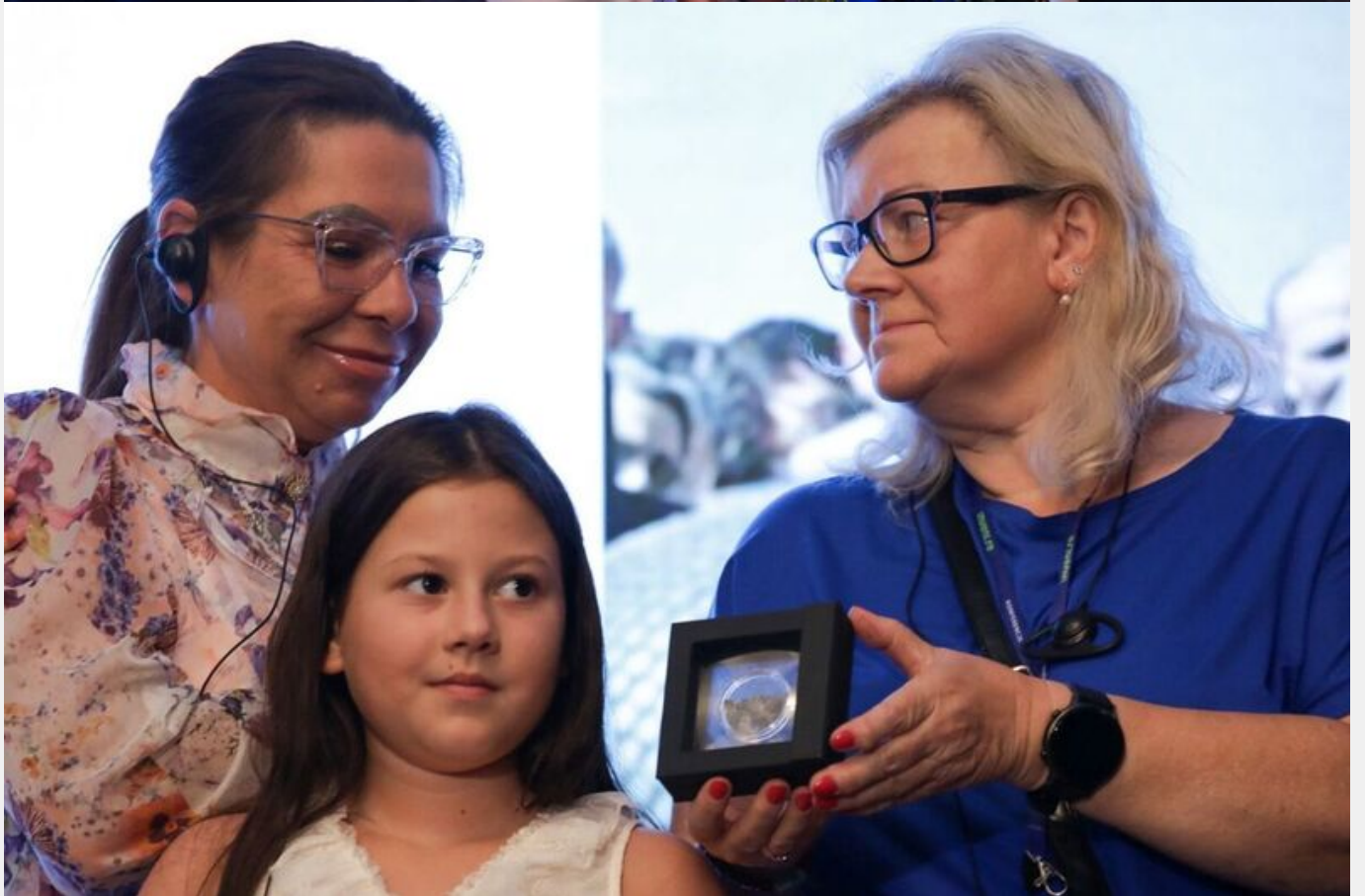
On 19 July 2023, at the Janusz Kurtyka Educational Center History Point