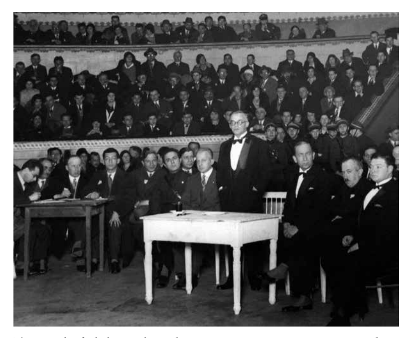
The Speech of Vladimir Jabotinsky, Warsaw, 14 May 1939.

The camp at the Kocierz Pass is the best documented Irgun training venture conducted in Poland before the outbreak of the Second World War. Training camps for the Betar or Irgun members were also organised in the following towns: Tro-