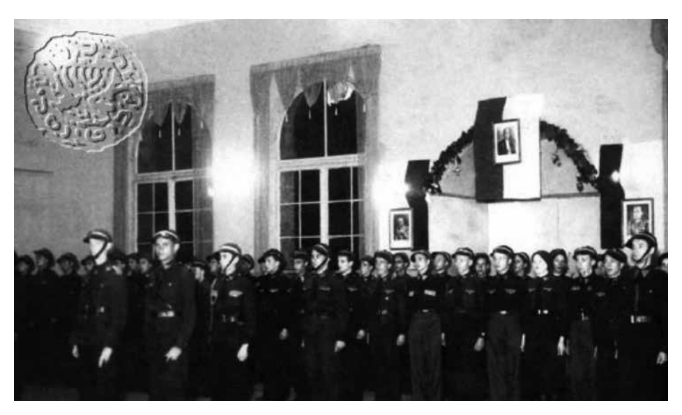
A Central Training Camp of the Betar, Lodz, 1939.

weapons and shoot live ammunition (partly financed by the Polish state budget) was as attractive to the organisation as a whole as it was to most of its young members. Another benefit was the possibility to carry weapons during patriotic ceremonies and official addresses – not only Polish ones. From the perspective of a young and unknown NGO, it would be hard to overestimate the propaganda impact on the Jewish community in Poland of the sight of armed and uniformed members appearing under Jewish national symbols – the menorah and the Star of David – of an organisation whose authority was further strengthened by the protection of the governmental leadership.66 From Warsaw's perspective, supporting the Betar in the Borderlands was particularly important – this is where most of the camps and training sessions were organised. The army and the administration trusted that this would make it possible to convince the second-largest minority in these areas to support the Polish state. The Betar strongly emphasised loyalty to Poland, so cooperation almost automatically strengthened the links between these lands and the rest of the country. In part, the Betar passed this loyalty test in September 1939, when they cooperated with the army in maintaining the internal order undetermined by Ukrainian gangs and communist subversive activity.