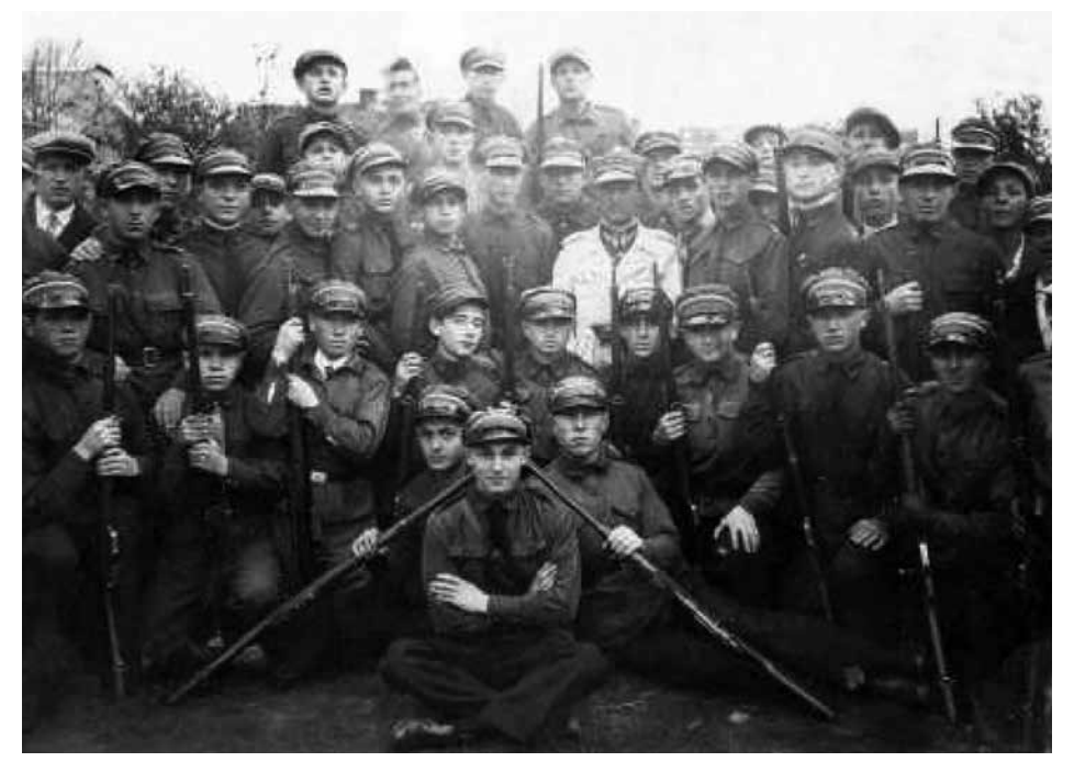
A Summer Training Camp for Members of the Betar, Pinsk, 1939.

The next step towards closer cooperation came in 1936. In July of that year, the Polish government agreed to military training for one hundred Betar candidates, most of whom came from Poland (the Polish foci of the worldwide organisation). Subsequent training courses in Rembertów, Zielonka and Międzyrzec Podlaski were held in October 1937 and January 1938, with about fifty participants each. <sup>67</sup> In August 1938, exercises were held in Trochenbrod (Polish: Zofiówka) in Volhynia, where some instructors and trainees had travelled from as far away as Palestine. This was the first officer (higher level) course organised for the Irgun members outside the Mandate territory. <sup>68</sup> In February 1939, the Revisionists, in cooperation with the Ministry of Military Affairs, began a series of courses lasting four to six weeks. These succeeded in training some 1,000 Betar members. <sup>69</sup>